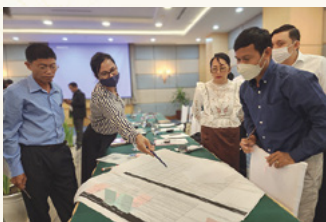
PICTURED ABOVE: STRENGTHENING CAPACITY FOR MARINE DEBRIS REDUCTION IN ASEAN REGION THROUGH FORMULATION OF NATIONAL ACTION PLANS FOR ASEAN MEMBER STATES AND INTEGRATED LAND-TO-SEA POLICY APPROACH

Japan provided approximately 10 million US dollars through JAIF for human resource development, awareness-raising and public relations activities of environmental preservation including reduction of marine plastic litters in ASEAN countries. Six projects for production of documentary programmes on marine debris, regional joint research and capacity building for monitoring and reduction of marine debris from fisheries, formulation of National Action Plans, decentralised domestic waste water management, the promotion of plastic circular society, and the ASEAN SDGs Frontrunner Cities Programme for addressing land-based plastic marine debris have been or are being implemented.