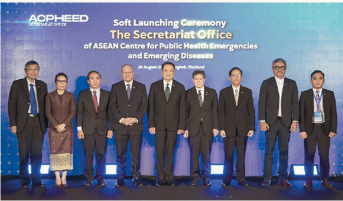
PICTURED ABOVE: ASEAN CENTER FOR PUBLIC HEALTH EMERGENCIES AND EMERGING DISEASES (ACPHEED)

ASEAN COORDINATING CENTRE FOR HUMANITARIAN ASSISTANCE ON DISASTER MANAGEMENT (AHA CENTRE) As the home of One ASEAN One Response, AHA Centre facilitates ASEAN Collective response to disasters in the ASEAN region. Through JAIF projects, Japan has supported the establishment of an integrated information and communication technology (ICT) system and the Disaster Emergency Logistic System for ASEAN (DELSA), capacity building of the ASEAN-Emergency Response and Assessment Team (ASEAN-ERAT), and the AHA Centre Executive (ACE) Programme continuously.