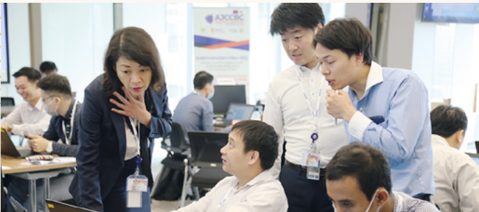
PICTURED ABOVE: ASEAN-JAPAN CYBERSECURITY CAPACITY BUILDING CENTRE

ASEAN-JAPAN CYBERSECURITY CAPACITY BUILDING CENTRE (AJCCBC) Japan also assists ASEAN Member States in other essential economic measures. Since cyberspace has a global reach beyond national borders, cooperation with countries is essential for establishing cybersecurity. In the ASEAN region, the ASEAN-Japan Cybersecurity Capacity Building Centre has been conducting cybersecurity training programmes for government agencies and critical infrastructure providers, and organising a competition for young engineers and students selected from ASEAN countries to compete in cyber attack response skills, which will help improve cybersecurity capabilities in the ASEAN region. Since the establishment of the Centre, 1,480 participants from ASEAN Member States have attended these exercises.