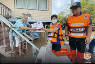
PICTURED ABOVE: THE DISASTER EMERGENCY LOGISTICS SYSTEM FOR ASEAN (DELSA)

JAIF projects that underpin the Sustainable Development Goals seek to realise the pledge to “leave no one behind” in eradicating poverty and creating a more sustainable world.