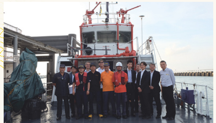
PICTURED ABOVE: JOINT HYDROGRAPHIC SURVEY OF THE STRAITS OF MALACCA & SINGAPORE

Senior Assistant Surveyor, Maritime Operating Division, Marine Department of Malaysia