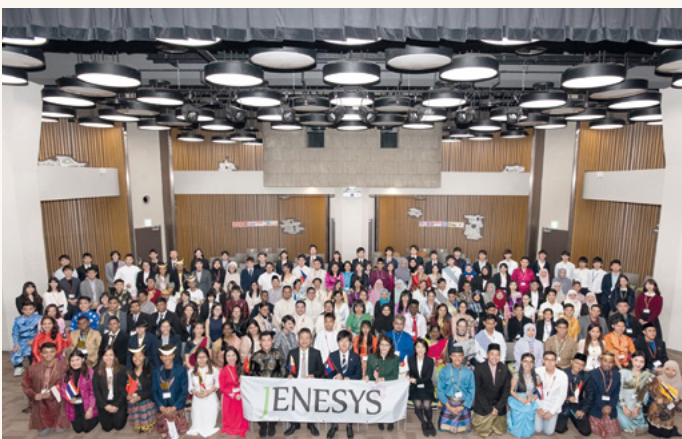
PICTURED ABOVE: JAPAN-EAST ASIA NETWORK OF EXCHANGE FOR STUDENTS AND YOUTHS (JENESYS)

With the support of JAIF, approximately 6,400 youths participated in JENESYS2020 and JENESYS2021 online programs. Under JENESYS2022, a hybrid of online and face-to-face exchanges is being implemented.